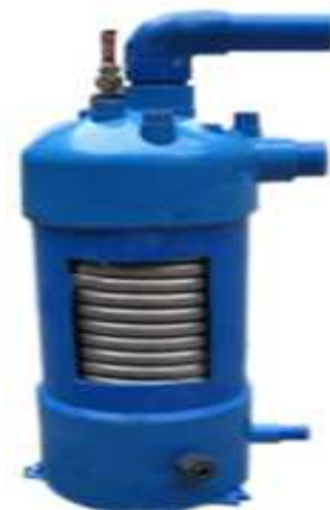
PVC-Titanium Heat Exchanger

Pacific Heating & Cooling Tech. Ltd www.pacificnac.nz